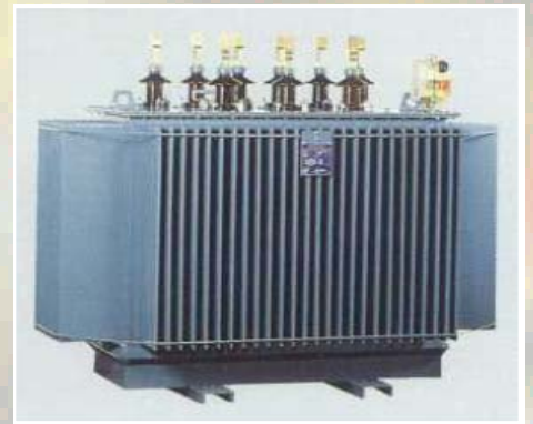
Distribution transformer Primary: 20 000V - Secondary: 410V Power: 1 600 kVA