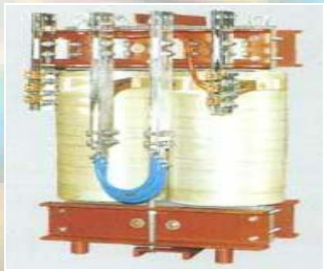
Water cooled inductance 0,6mH 2 825A