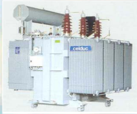
High power transformers Primary: 63 000V - Secondary: 5 800V Power: 6 300 kVA