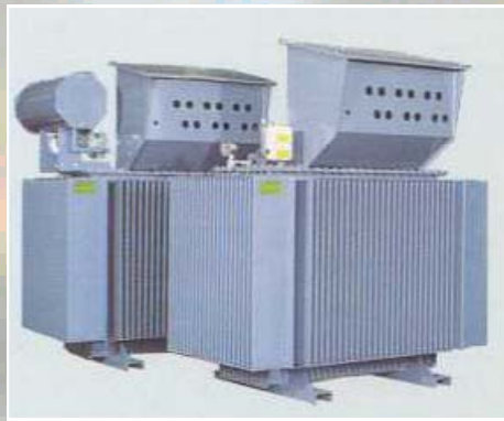
Distribution transformer Primary: 20 000V - Secondary: 410V Power: 1 600 kVA