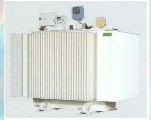
Inductance for compensation 21 000V Power: 3 000 kVAR