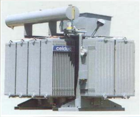
High power transformers Primary: 15 750V - Secondary: 3 200V Power: 1 000 kVA